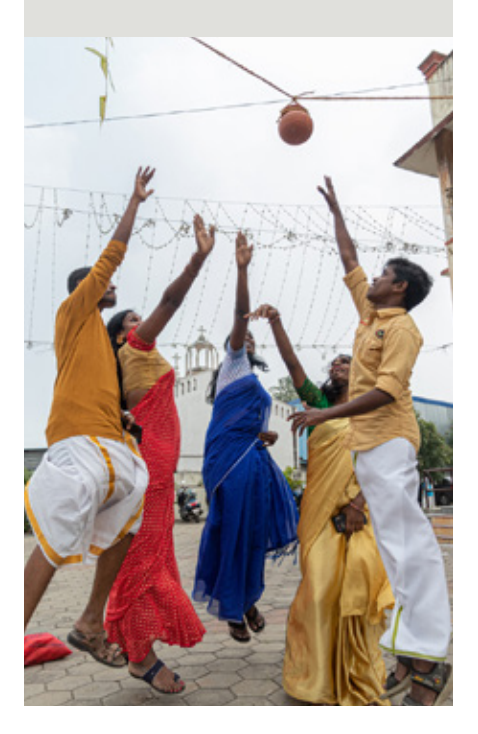
Members of the Rotary Club of Madras Elite, India, attempt to break a hanging pot in celebration of Pongal, a harvest festival celebrated in Tamil Nadu each January.

Or make an outright gift now and see your legacy at work during your lifetime!