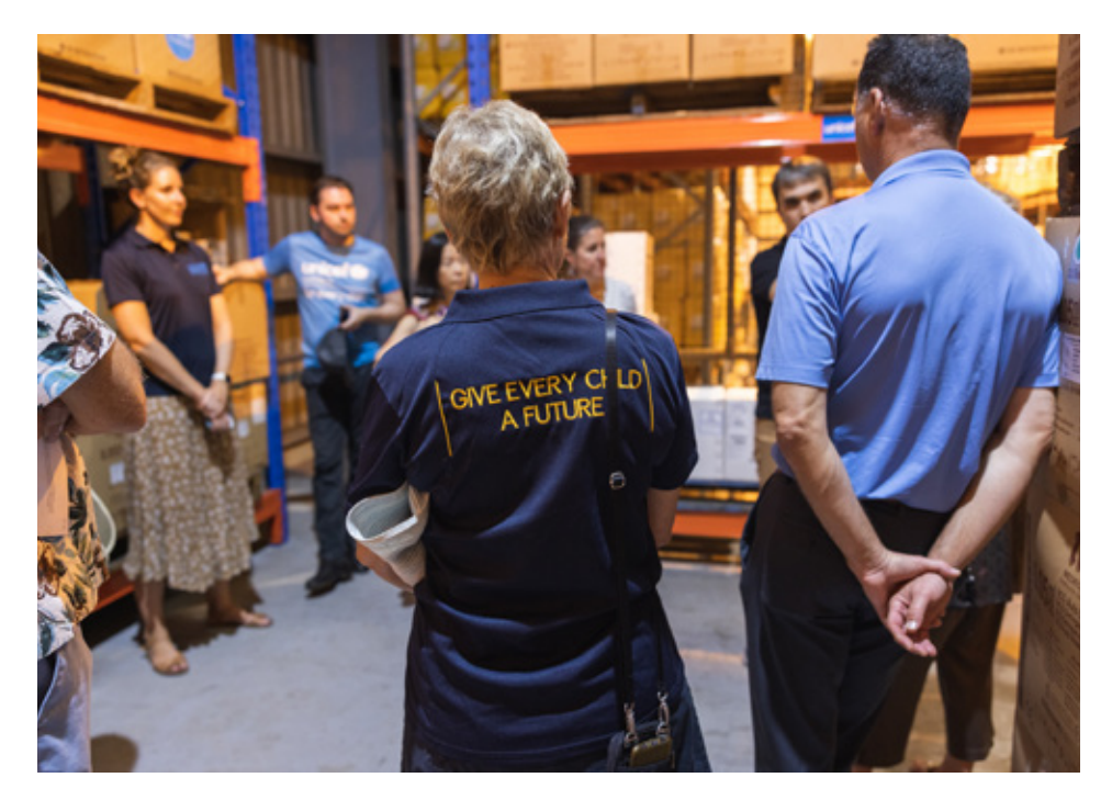
Partners from UNICEF tour a vaccine distribution warehouse during a visit to Fiji. Rotary members from 21 districts, in partnership with UNICEF, are working with local governments to develop and implement immunization programs to protect 100,000 children from rotavirus, pneumococcal disease, and cervical cancer across nine South Pacific Island countries.

You know first-hand that Rotary members answer quiet calls for help around the world every day. Connecting these voices to the right solution doesn't happen without tireless effort and valuable resources. Your annual gifts to The Rotary Foundation help people around the globe today . Your support of Rotary's Endowment will support the same life-changing programs forever .