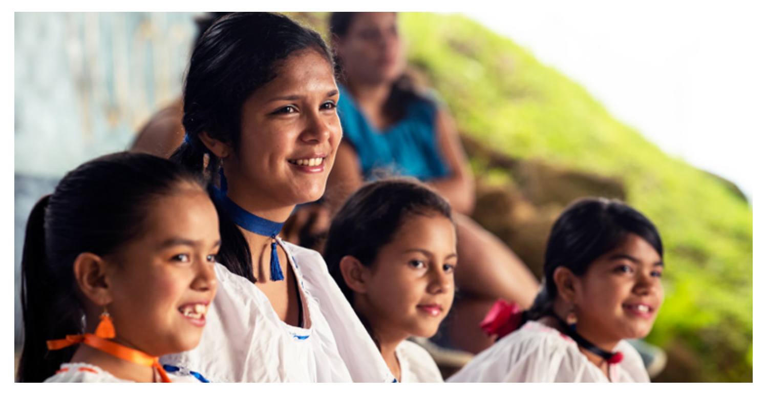
A Rotary global grant, working in partnership with CATIE, provides support for training in business skills and aquaponic gardening, and the development of an ecolodge for tour groups and training in Costa Rica.

Rotary's Promise Club 100%-member support of TRF's Endowment at $1,000 or greater by outright gift/s or a commitment.